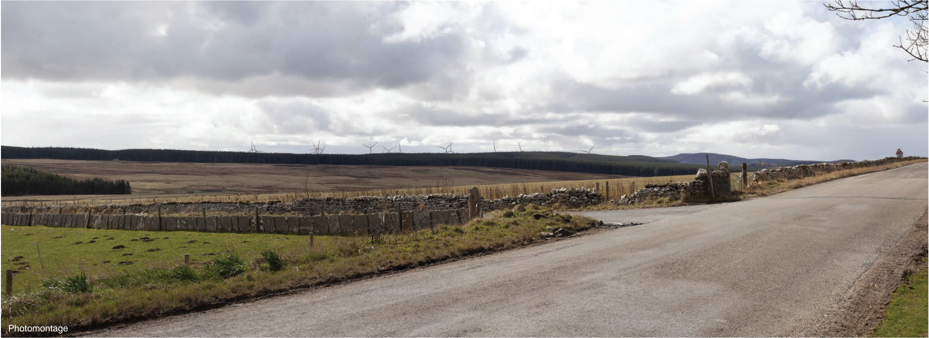
Viewpoint 4: Shebster

Distance to nearest turbine: 3.747km Camera: EOS 5D Mark II Focal length: 50mm vertical (27°) x 28mm horizontal (65.5°) Camera height: 1.5m Date: 12/04/21 Time: 14:16