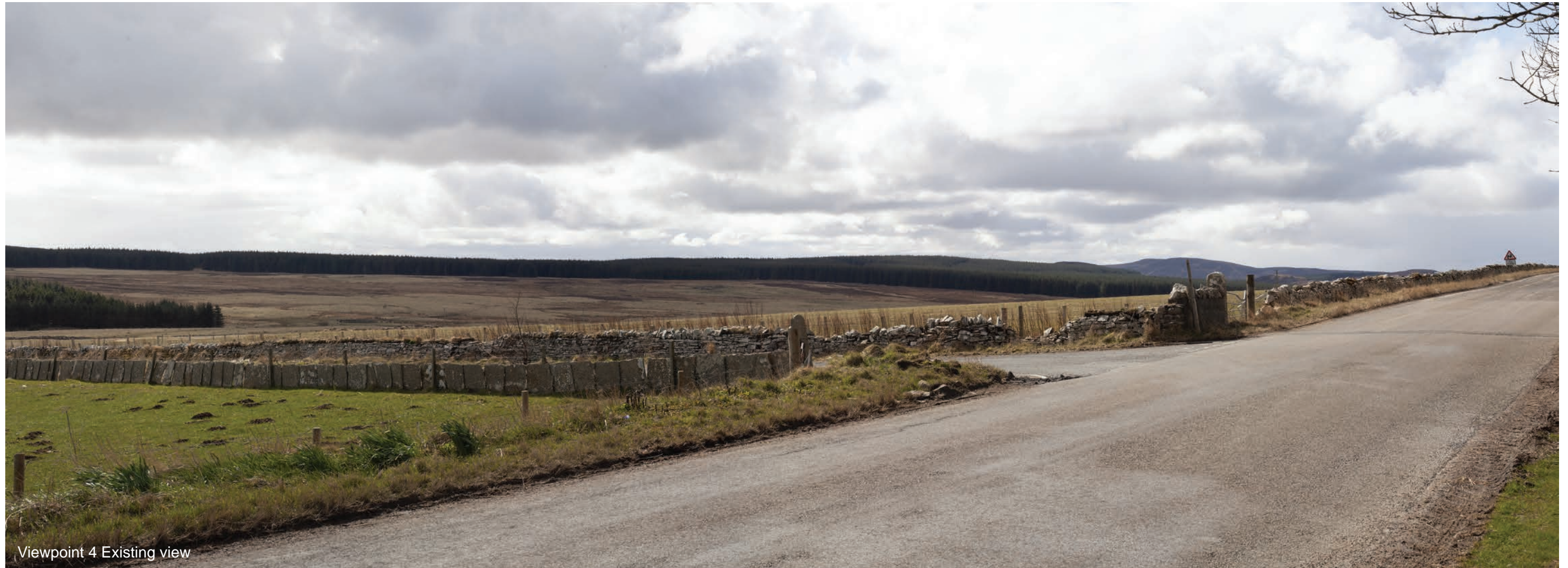
Viewpoint 4 Existing view