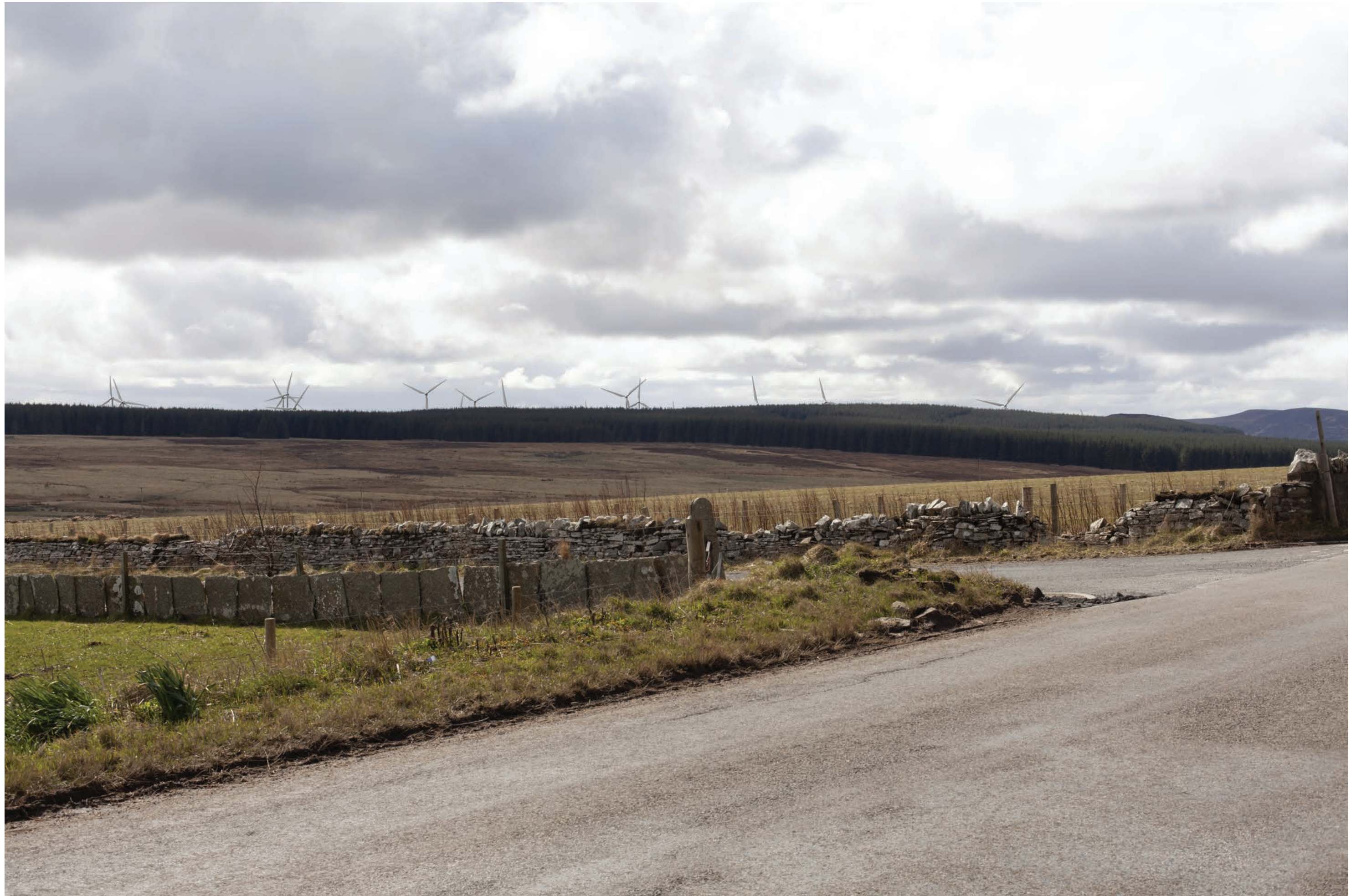
Viewpoint 4: Shebster