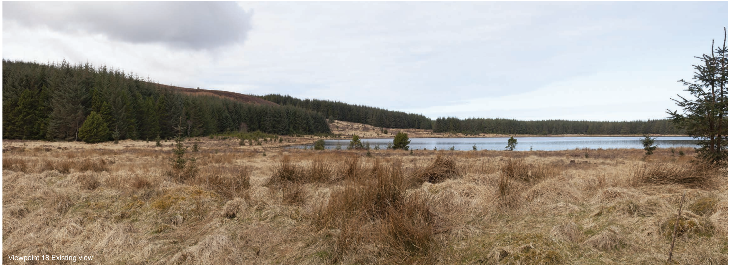
Viewpoint 18 Existing view