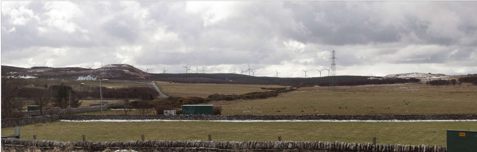
Photomontage showing consented Limekiln Wind Farm