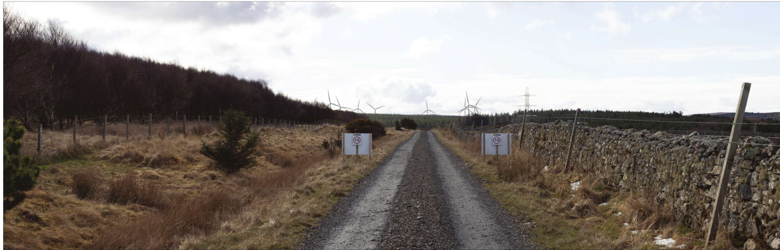
Photomontage showing proposed Limekiln Wind Farm