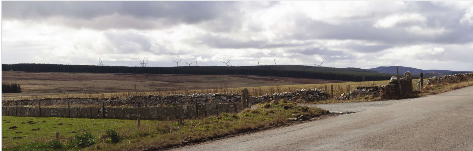
Photomontage showing proposed Limekiln Wind Farm