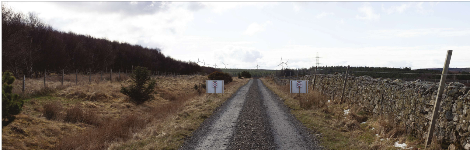
Photomontage showing consented Limekiln Wind Farm

OS Reference: - 296149 E 964385 N Eye level: - c 29.1 m AOD Direction of view: - 159 degrees Nearest turbine: - 3.16 km Horizontal field of view - 53.5 degrees Viewing distance - View flat at a comfortable arm's length Paper size: - 841 x 841 mm Correct printed image sizes: - 820 x 260 mm Camera height: - 1.5 m AGL Turbine height (to tip): - 149.9m