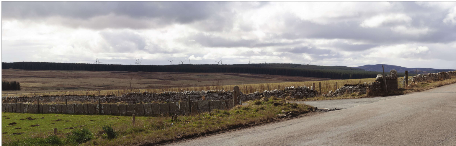
Photomontage showing consented Limekiln Wind Farm

OS Reference: - 301776 E 963941 N Eye level: - c 83.2 m AOD Direction of view: - 229 degrees Nearest turbine: - 3.75 km Horizontal field of view: - 53.5 degrees Viewing distance: - View flat at a comfortable arm's length Paper size: - 841 x 841 mm Correct printed image sizes: - 820 x 260 mm Camera height: - 1.5 m AGL Turbine height (to tip): - 149.9m