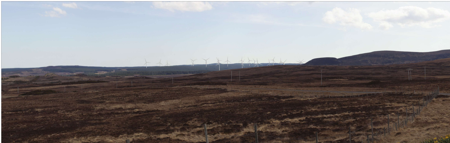
Photomontage showing proposed Limekiln Wind Farm