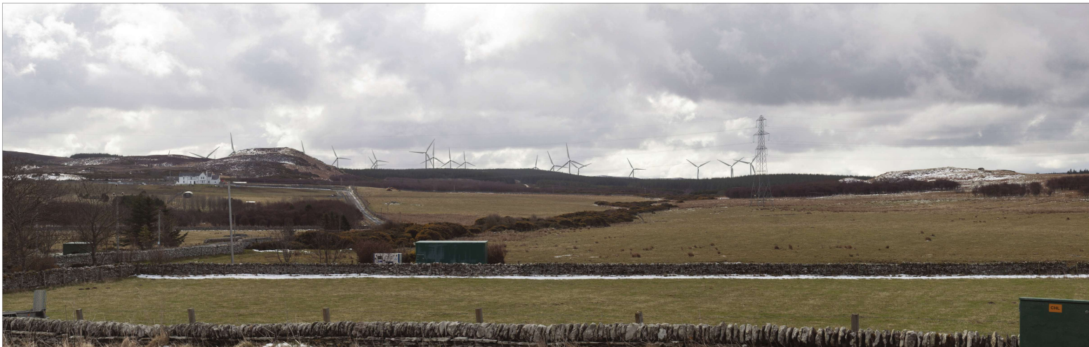
Photomontage showing proposed Limekiln Wind Farm