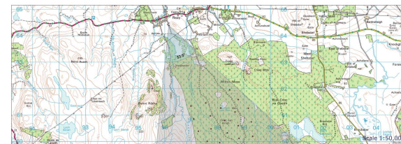
Viewpoint location plan

Note: Visualisations can give an impression of the appearance of a landscape and proposed wind farm. However neither photographs or visualisations can convey a view exactly as it would be seen by the human eye in reality.