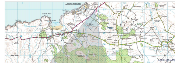
Viewpoint location plan

Note: Visualisations can give an impression of the appearance of a landscape and proposed wind farm. However neither photographs or visualisations can convey a view exactly as it would be seen by the human eye in reality.