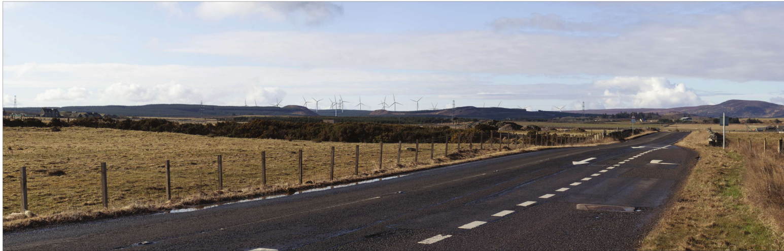
Photomontage showing proposed Limekiln Wind Farm