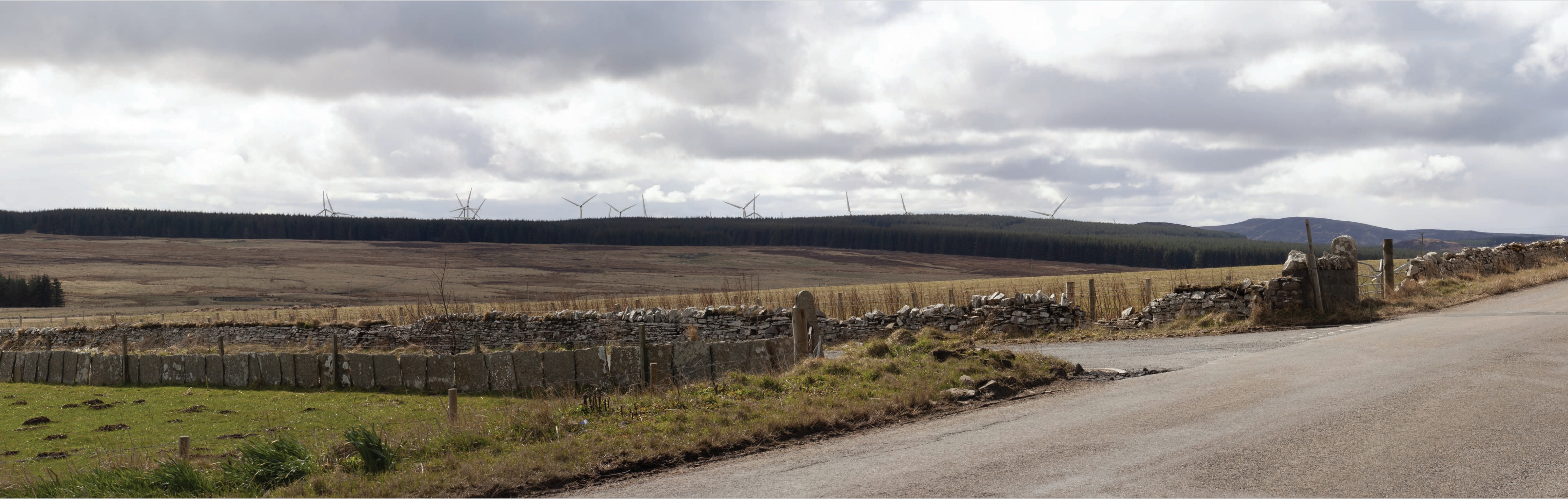
Photomontage showing proposed Limekiln Wind Farm