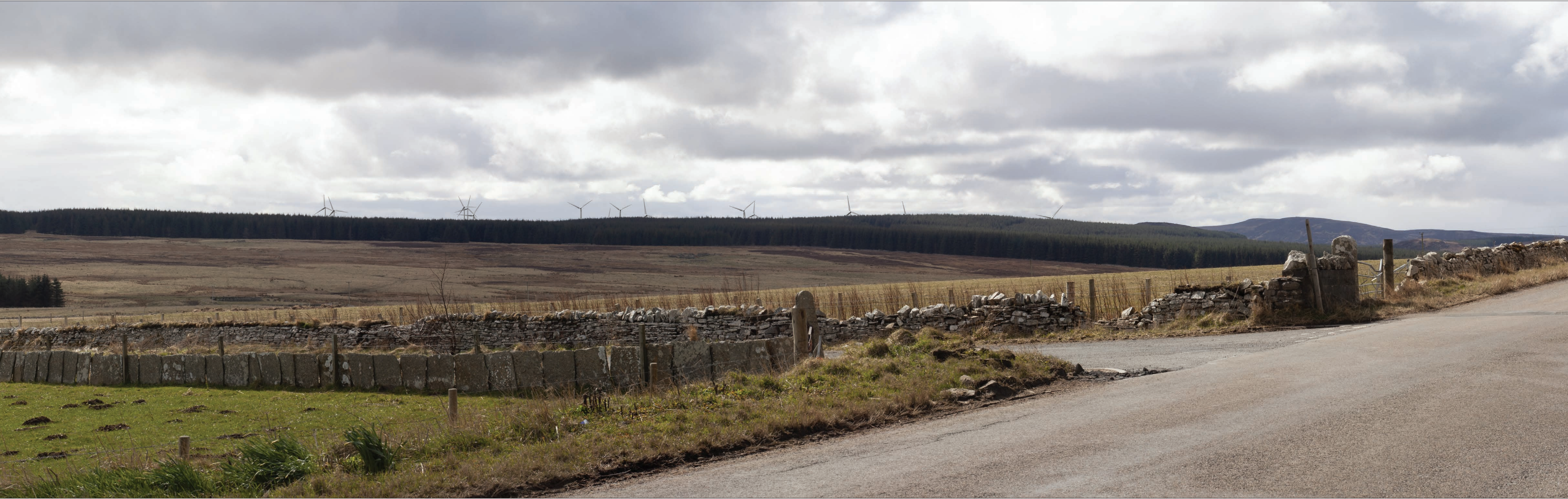
Photomontage showing consented Limekiln Wind Farm