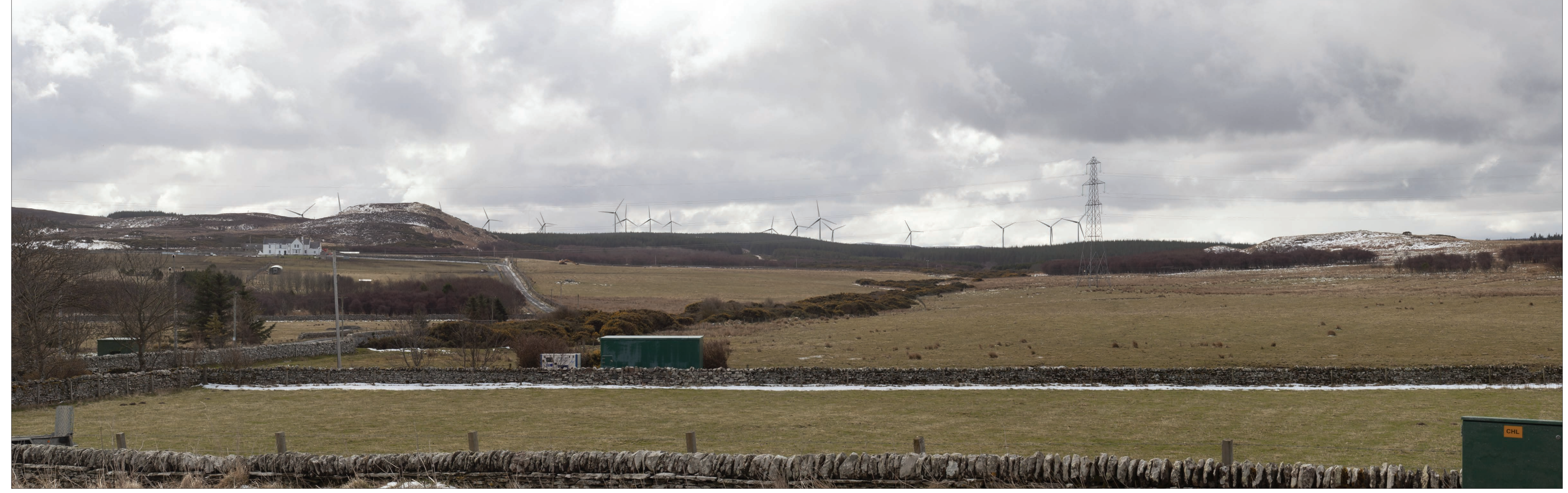
Photomontage showing consented Limekiln Wind Farm

OS Reference: - 296735 E 964816 N Eye level: - c 21.5 m AOD Direction of view: - 165 degrees