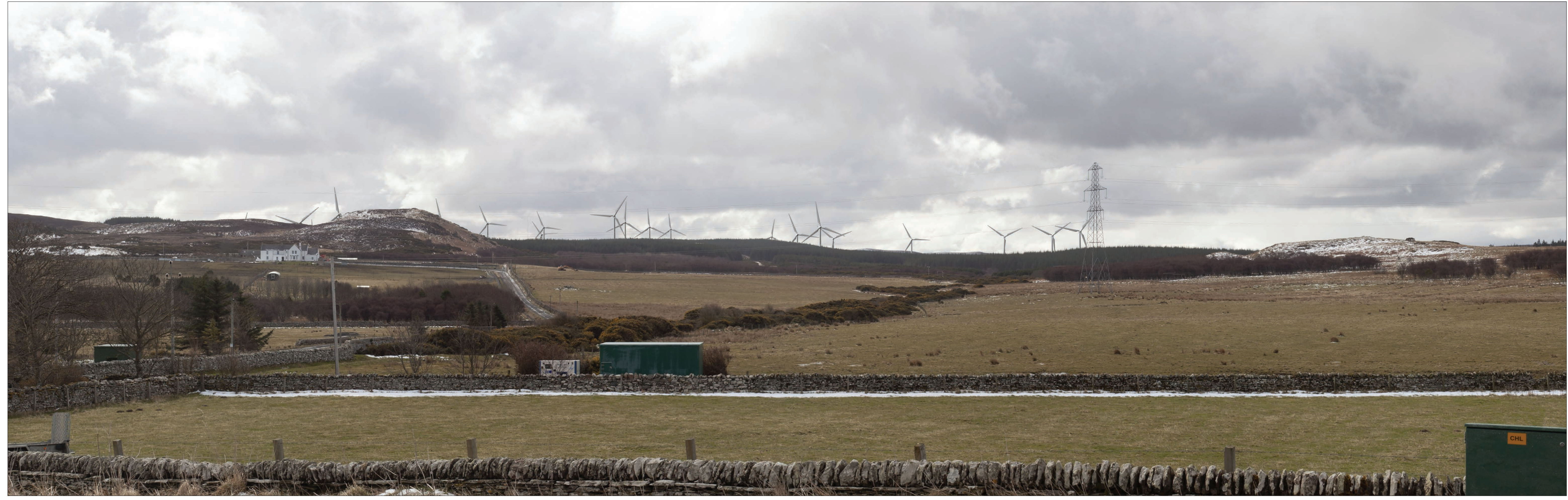
Photomontage showing proposed Limekiln Wind Farm