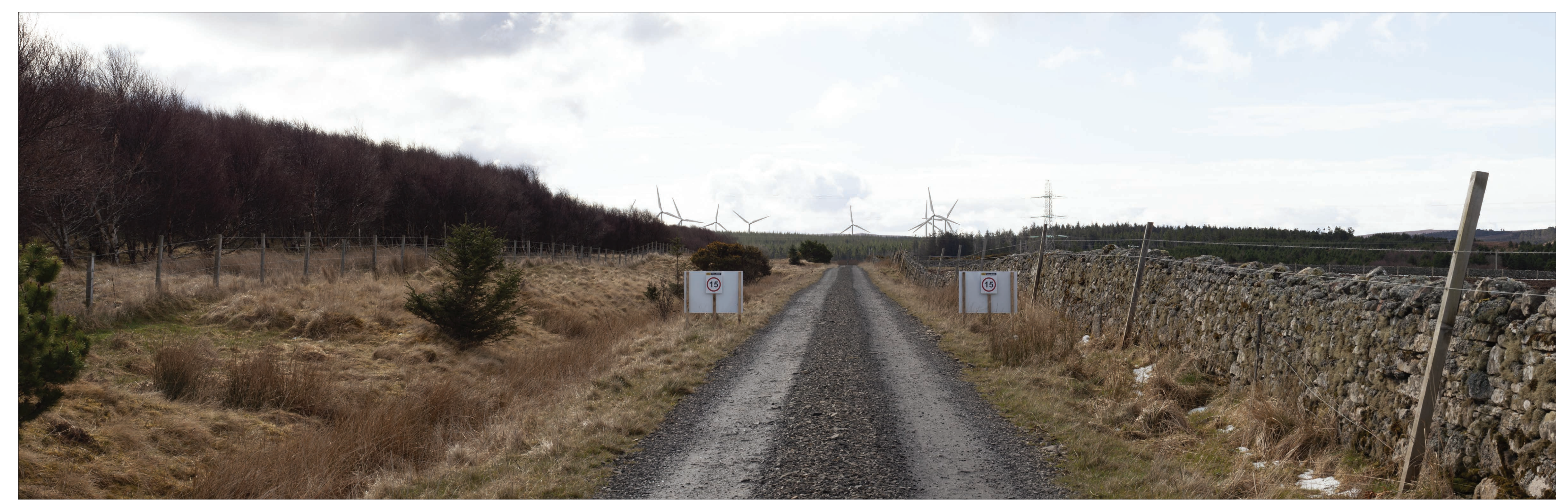
Photomontage showing proposed Limekiln Wind Farm