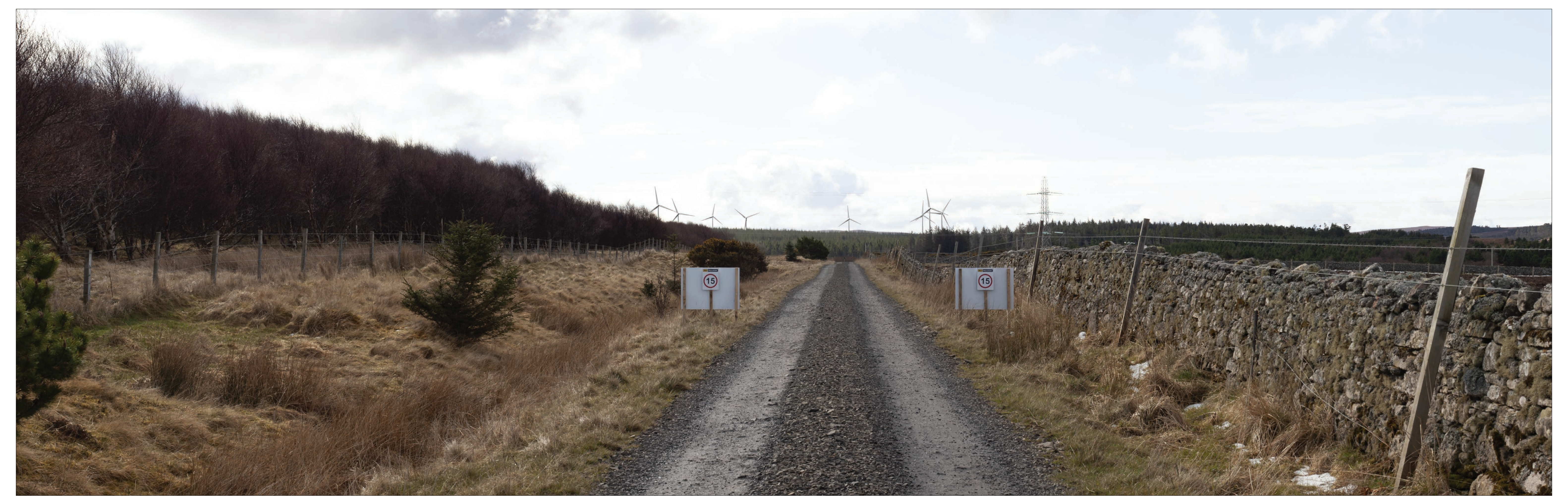
Photomontage showing consented Limekiln Wind Farm

- 296149 E 964385 N OS Reference: Eye level: - c 29.1 m AOD Direction of view: - 159 degrees